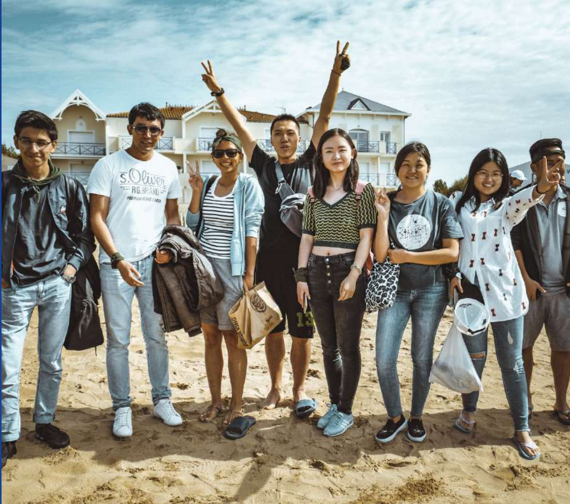
Design: Excelia All rights reserved - 03/2024 - This document is non-contractual. The Management reserves the right to modify content and dates.